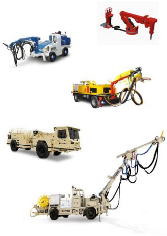
Machines with control systems

Scalable solutions for predictive maintenance and life-cycle management