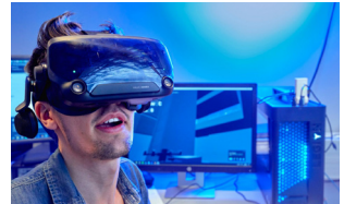
Digitalisation, Computing and Electronics, University of Oulu.

The Economics route has one progression option at Aalto University