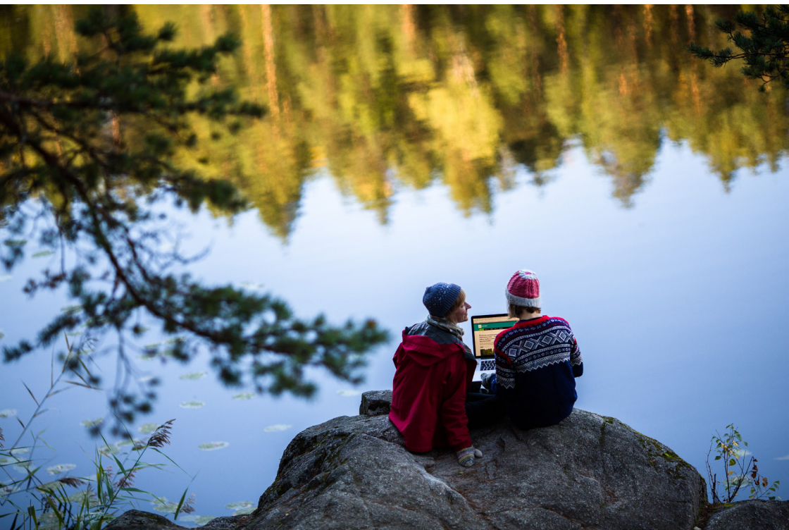
Image taken from Nuuksio National Park.

The University Pathway Finland gives international students an excellent opportunity to prepare and gain admission for degree studies in Finland while studying from home. The digital programme is offered by Aalto University, Tampere University and the University of Oulu, three of Finland's leading universities.