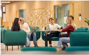
Economics, Aalto University.

By successfully completing the digital pathway programme and meeting the other admissions criteria, students can progress to study in one of the selected degree programmes.