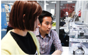
Science and Engineering, Tampere University.