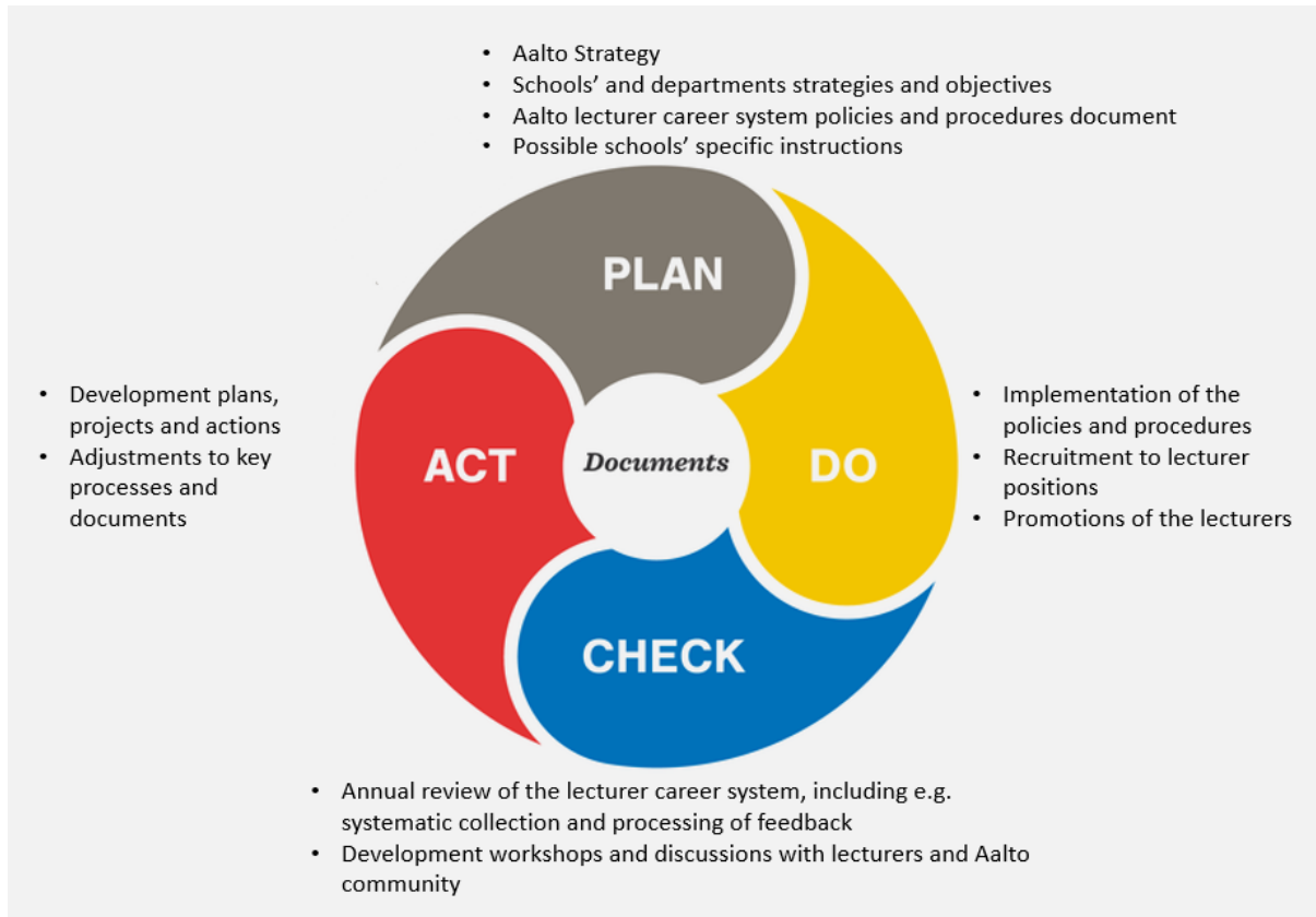
Figure 3. Plan, Do, Check and Act/Adjust (PDCA) cycle of the lecturer career system at Aalto University.

A good implementation requires regular monitoring and continuing development of the process. The quality management and development of the Aalto lecturer career system is part of Aalto University's overall quality system, and based on the principle of continuous development, i.e. the Plan, Do, Check, Act/Adjust cycle (PDCA cycle, see Figure 3).