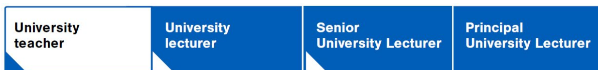
Figure 1. Overview of the lecturer career system.

The Aalto lecturer career system consists of four levels: university teacher, university lecturer, senior university lecturer, and principal university lecturer (see Figure 1.).