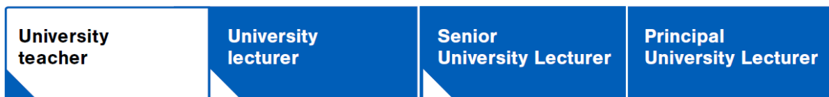
Figure 1. Overview of the lecturer career system.

The Aalto lecturer career system consists of four levels: university teacher, university lecturer, senior university lecturer, and principal university lecturer (see Figure 1.).