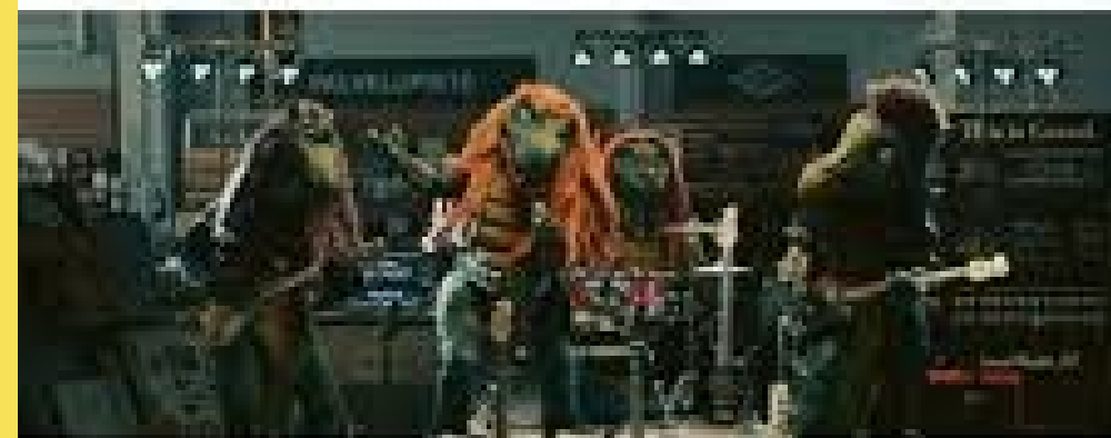
FINNISH SINGING DINOSAURS