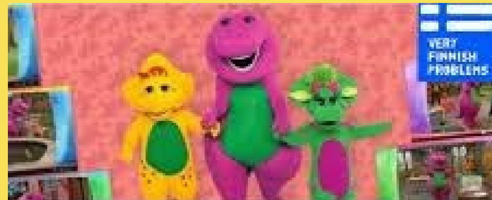
AMERICAN SINGING DINOSAURS

Make the most out of the exchange – how to become a master of intercultural communication through exchange