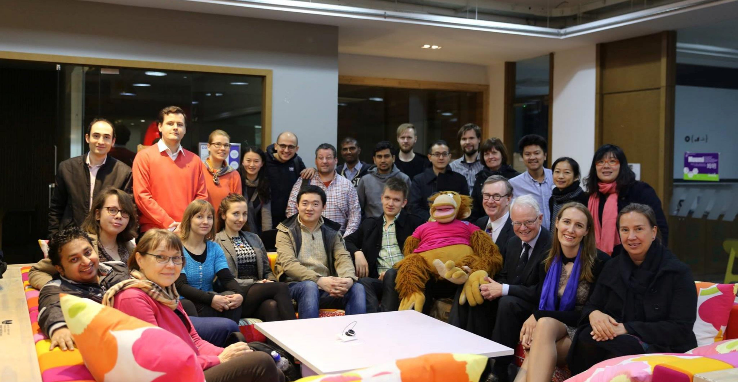
2014-2015 Bit Bang 7 Tongji University, Shanghai