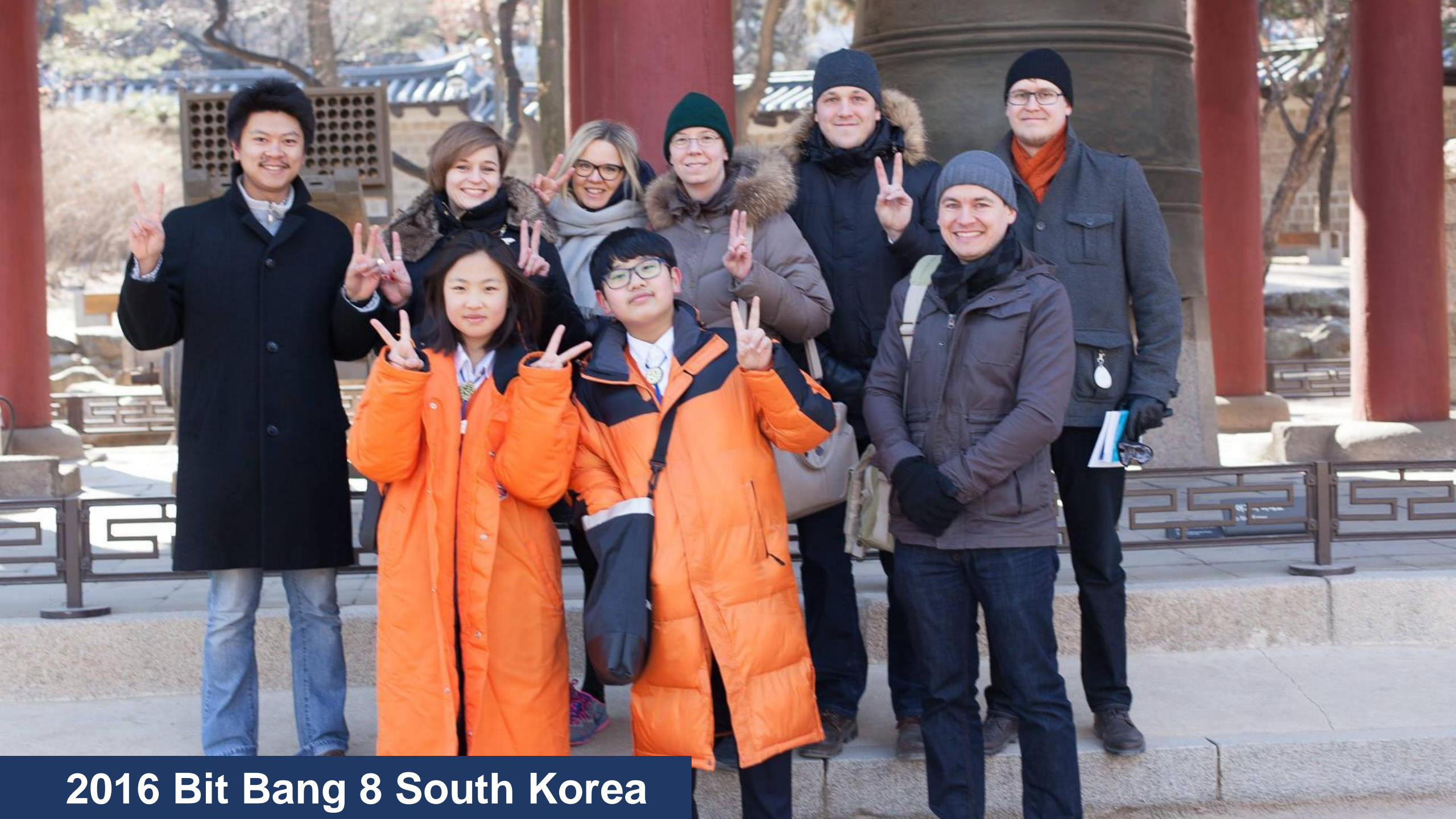
2016 Bit Bang 8 South Korea