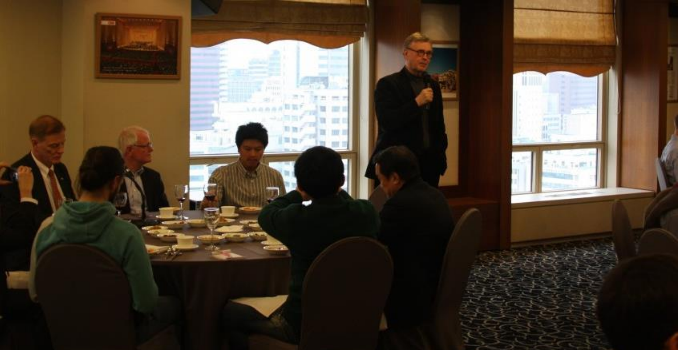
2016 Finnish Chamber of Commerce event (South Korea)